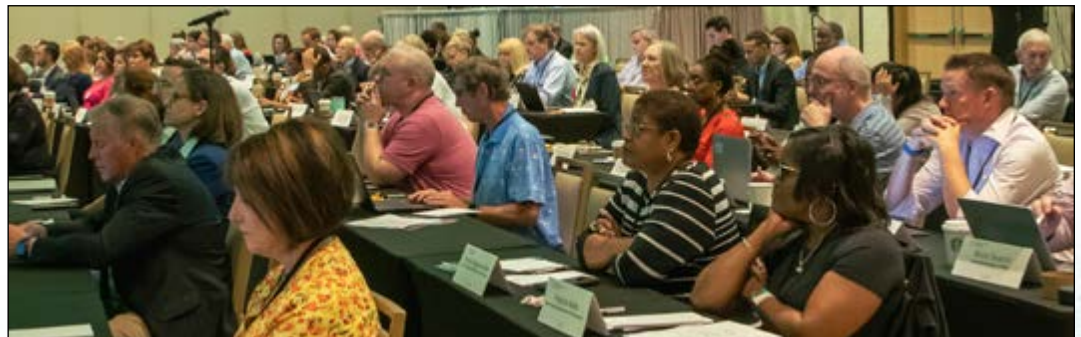
The concurrent conferences were the first in-person gatherings to be held for NASBA's membership since a three-year hiatus due to the COVID-19 pandemic. NASBA is pleased to bring back this format and hopes to continue for future meetings and conferences.