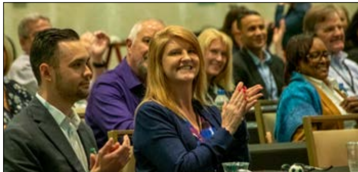
Meeting attendees are excited for the 40th Annual Conference for Executive Directors and Board Staff and the 27th Annual Conference for Board of Accountancy Legal Counsel.