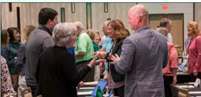
To kick-off the meeting, attendees participate in an ice-breaker of getting to know each other after the long pause due to the COVID-19 pandemic.