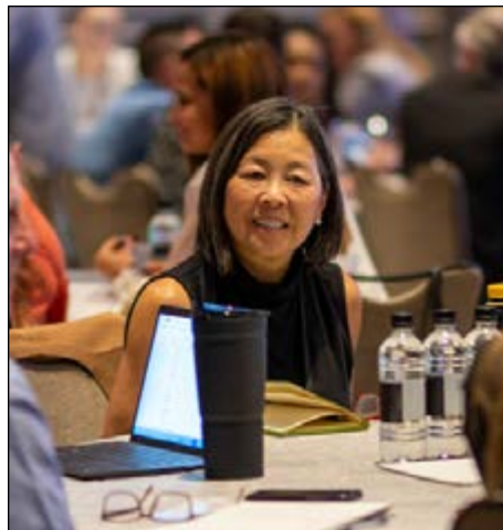
Summit attendees were excited to gather in-person following two years of virtual meetings.