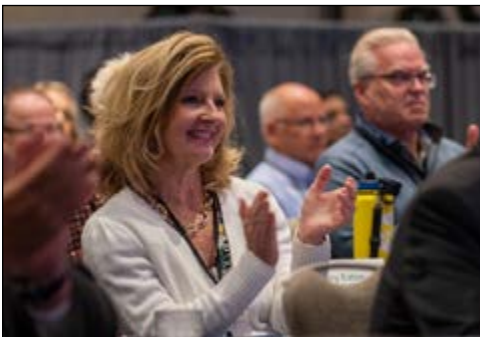
Attendees were glad to 'rebound' at the first in-person Annual Meeting since 2019.