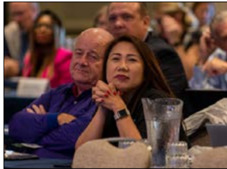
NASBA hosted 213 in-person meeting attendees in San Diego, CA, with an additional 97 virtual attendees.