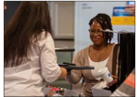
NASBA was pleased to welcome members and stakeholders to the Manchester Grand Hyatt.