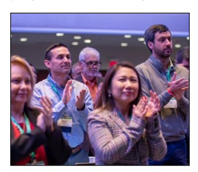
Attendees were glad to learn about the 'New Beginnings' that NASBA has in store.