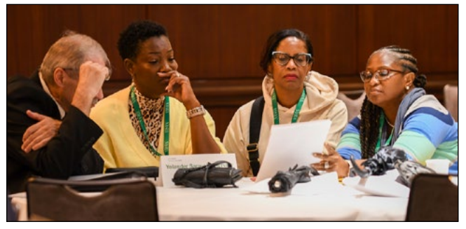
Board of Accountancy members participate in a pre-conference ethics workshop presnted by the NASBA Center for the Public Trust.