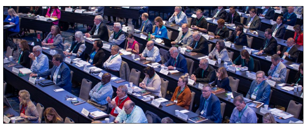
NASBA hosted 276 in-person meeting attendees in New York, NY, with an additional 76 virtual attendees.