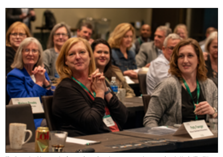
The Executive Directors Conference hosted 121 in-person meeting attendees in Nashville, TN, with an additional 21 virtual attendees.

NASBA's Executive Directors Committee and Legal team look forward to planning two amazing conference agendas for 2025. ◆