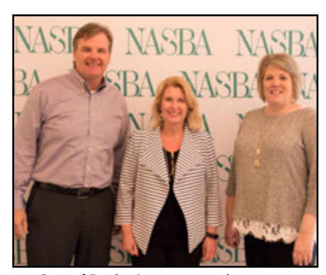
Central Region's representatives meet.