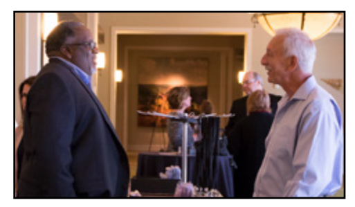
Time for networking, soda and photos.