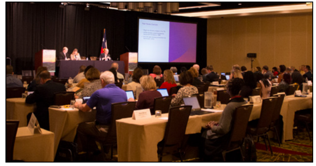
Executive Directors listen to dicussion of peer review oversight and the program's improvements.