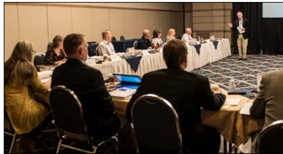
New Board Member Orientation – Western Regional Meeting