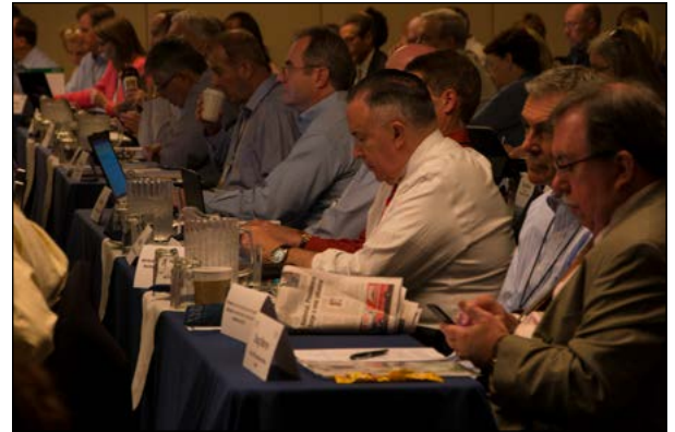
Western Regional listens to Examinations Review Board's report.