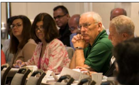
Eastern Regional covers UAA changes and drafts.