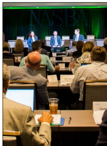
The Eastern Regional Meeting gathered 236 attendees in Newport.