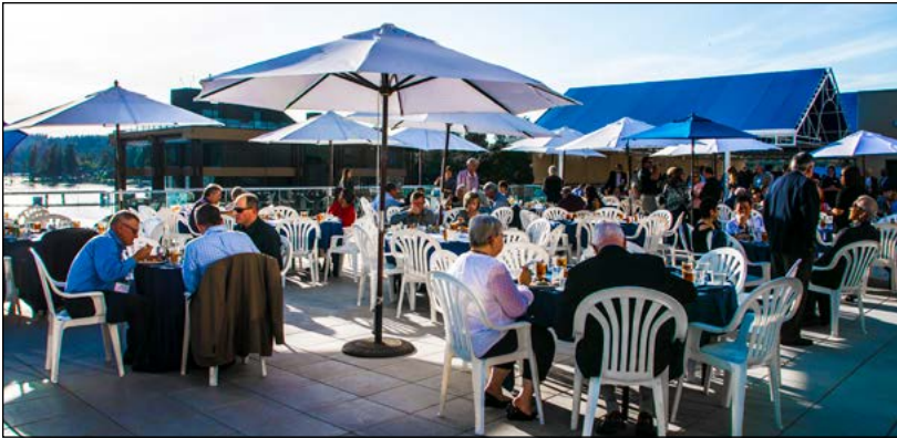
Western Regional Meeting welcome reception on the Coeur d'Alene Resort's terrace.

Discussions during the Regional breakout sessions at each of the Regional Meetings showed many Boards were unfamiliar with this topic and more information is required. ♦