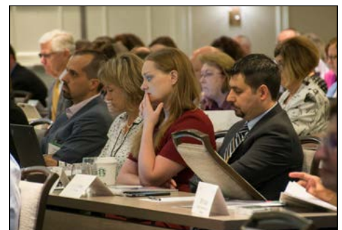
Eastern Regional considers education accreditation.