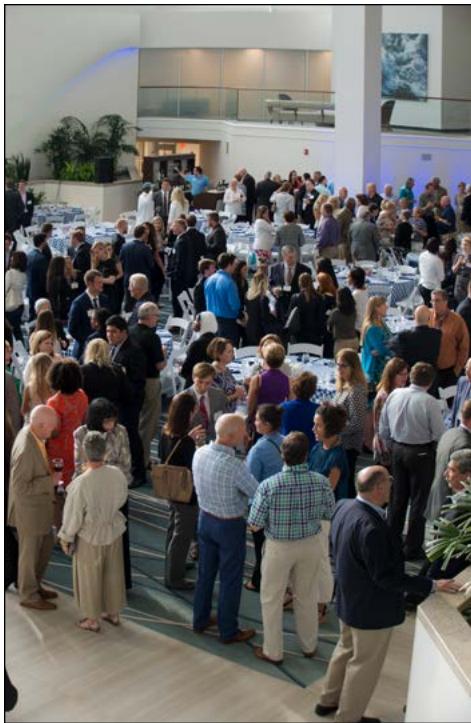
Eastern Regional Meeting luncheon networking.