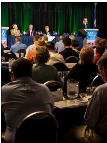
The Western Regional gathered 198 attendees in Coeur d’Alene.

Total registration for the Western Regional Meeting was 198 and for the Eastern 236, with all but one Board of Accountancy represented at either one or the other. ♦