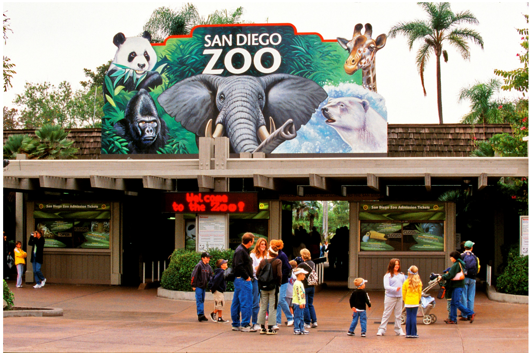
San Diego Zoo