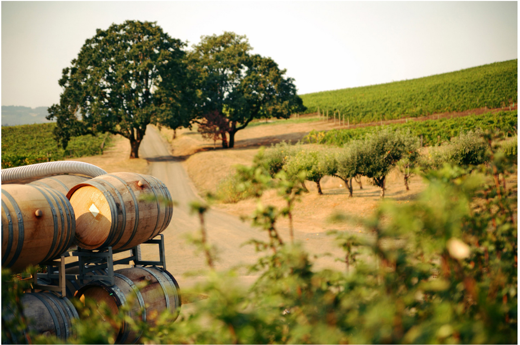
California Wine Country