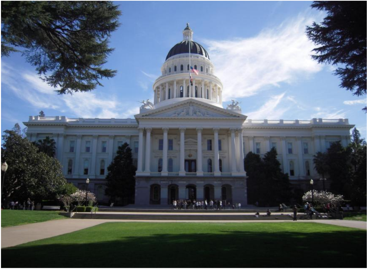
State Capitol, Sacramento