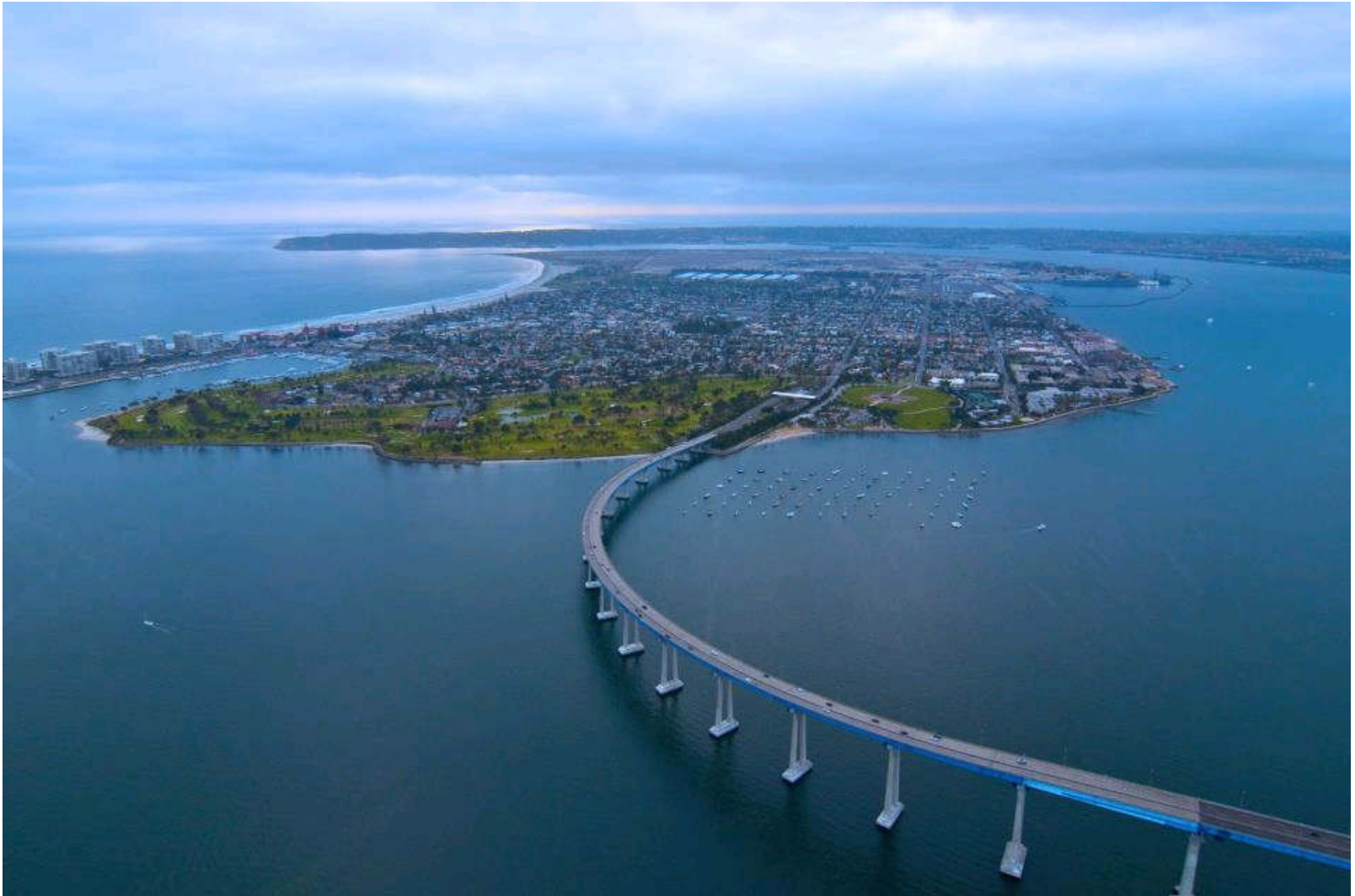
Coronado Bridge, San Diego