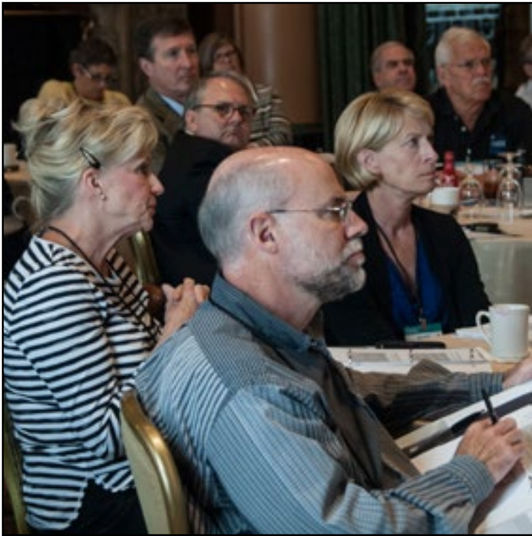
Meeting attendees consider proposed changes at a breakout session.