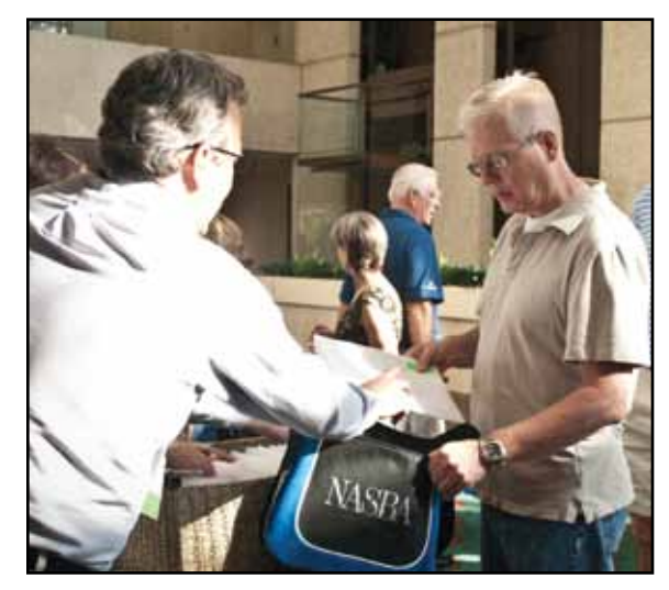
NASBA staff welcomes attendees to the Annual Meeting.