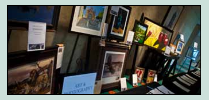
CPT hosted its first silent auction at the 2010 NASBA Annual Meeting with over 100 items.

in the CPT middle Tennessee student video contest for a short film on "Trust." He predicted, "That competition will become something of national significance."